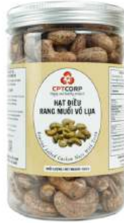
Dry Roasted Salted Cashews with Skin