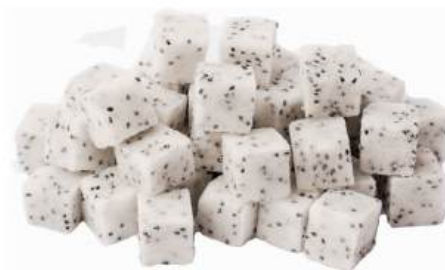
Frozen White Dragon