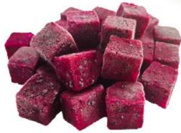
Frozen Red Dragon