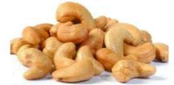
Roasted Cashews with Oil