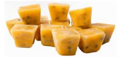
Frozen Passion Fruit