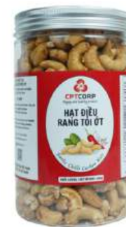
Garlic Chilli Cashews