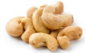
Roasted Salted Cashews with Oil